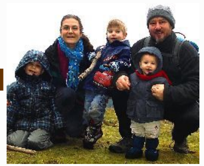
Family retreat on Mayne Island