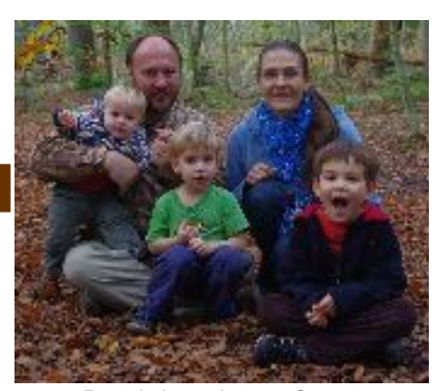
Dutch beech tree forest