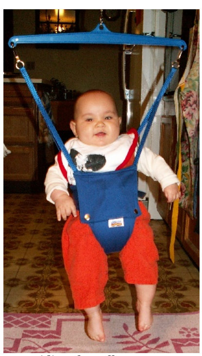
riding the Jolly Jumper

he is heavier than 99 and taller than 75) and, according to us, into the 100th percentile for cuteness!! In short, we are in love! We are enjoying being parents – it is amazing to watch him learn and grow before our eyes. And yet, parenthood draws deep on patience, love and resilience in the face of little sleep. We are